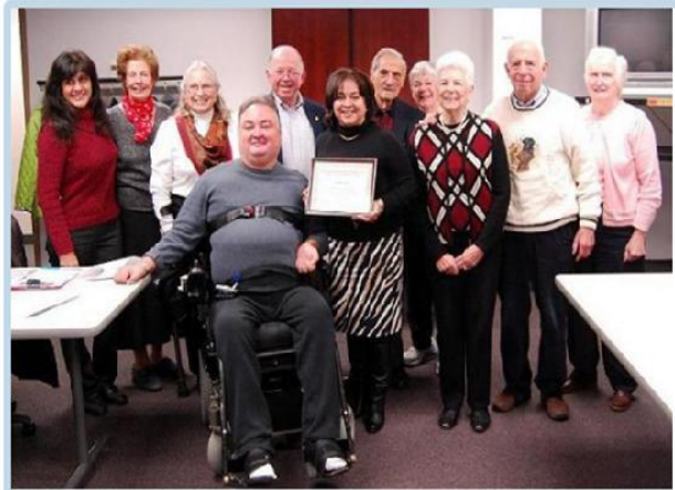
What a great first year! I am happy to say it's been a fun and successful year. SWIM, Inc. has been a blessing to me and I am looking forward to my second year as Executive Director. We started the year with not just a Strategic Plan, but a Plan of Action. New Goals, New Board, New Chapters and our very First Fund Raising Event. It's been fun and exciting! Building a sustainable business plan was my goal and the goal of the Board. We have a beginning and a good start on those plans. Receiving the 2010 Somerset County Disability Advocate Award and recognition on November 10th, was a great way to give thanks to the many volunteers of SWIM, Inc.